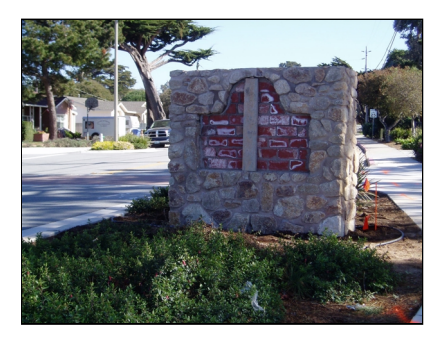
Entry sign under construction!

City of Monterey and second, to let motorists clearly know as they left our commercial district they were entering a thing solid put in the medians (Ramona residential neighborhood.