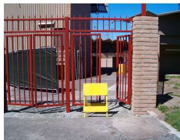
New Entrance and Entry on South side of the Pattee Arena