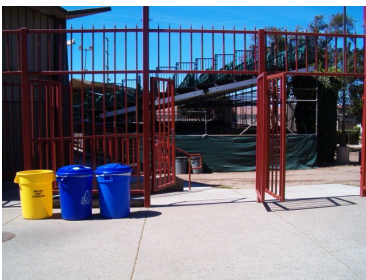
New Entrance and ADA Ramp On North side of the Pattee Arena