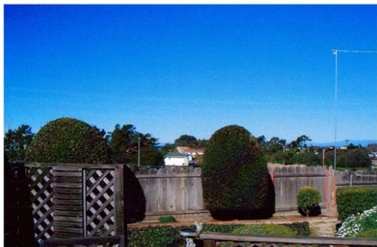
Looking From Deck