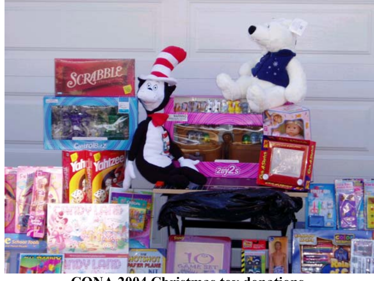
CONA 2004 Christmas toy donations

We had another successful toy drive (see photo) with three dozen gifts and gift wrap donated by CONA members. The wrap party was wonderful, we can still use more help. Next year we need to fill in some gaps in the age groups. It turns out we are weak in the 10 to 16 age group. We had lots for 3 to 8 year olds presents.